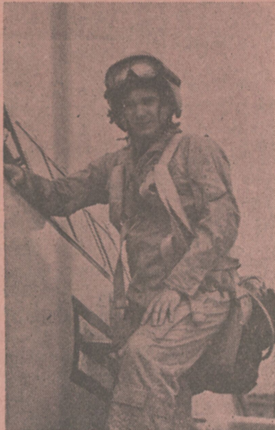
WANTED for crimes against the state