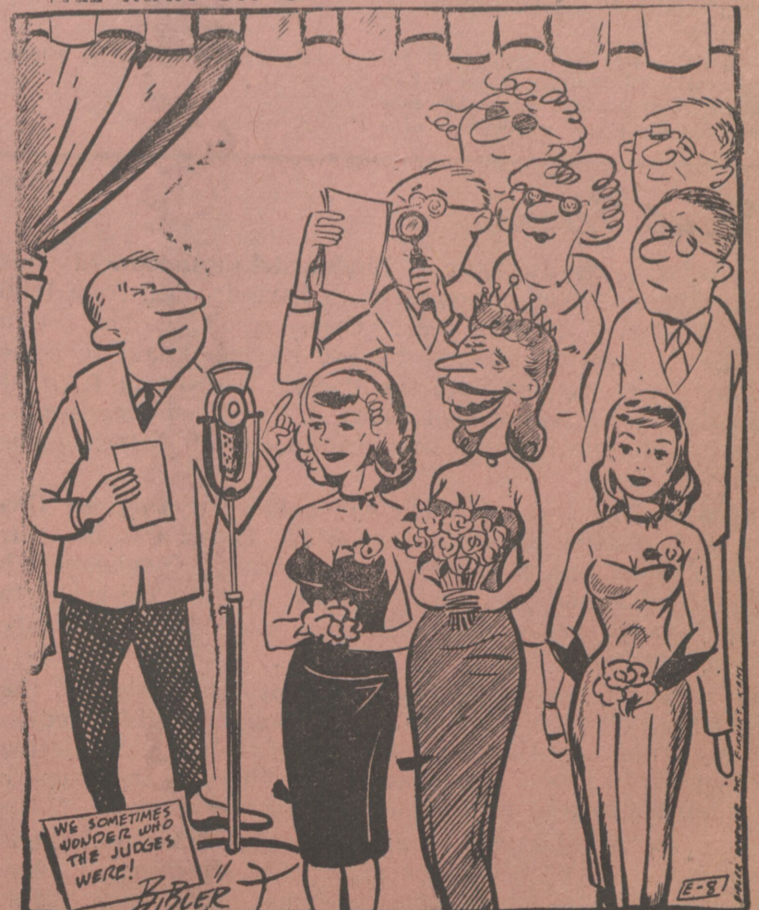
"... And our lovely Homecoming Queen will be glad to know her picture will be included with pictures of other Communist Cover-type Girls in the Minneapolis Red Star."