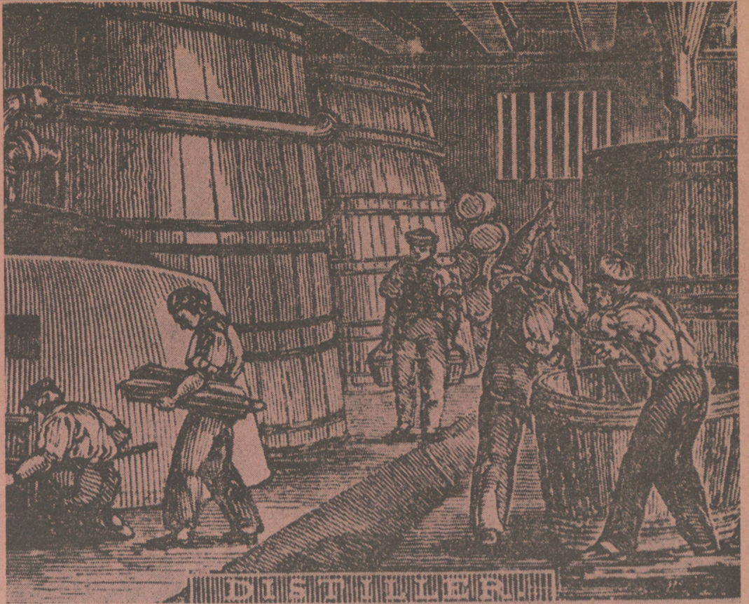
Under the direction of Comrade Laschkovitch, glorious athletes of the Regeme labor relentlessly in the People's College distillery. The distillery provides income for training table consumption.