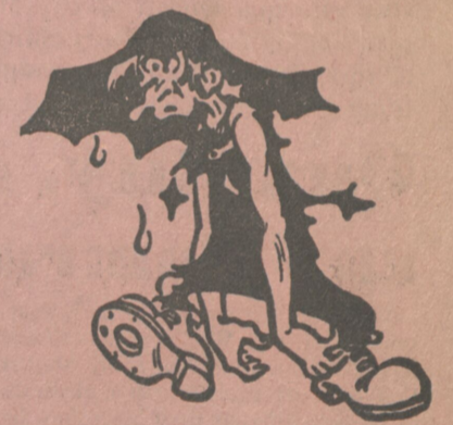
Big brother is watching you.

Everyone is talking about our recent tours to Korea, Indo-China, and Tibet. In fact, they proved so popular, we're now joining a bigger and better tour to Formosa. Sign up now and join hundreds of thousands of eager tourists massing on the Mainland.