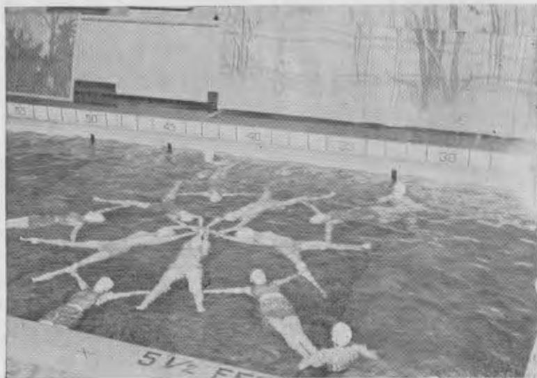
Swimming Pool—A water festival, cool, relaxing after a warm day