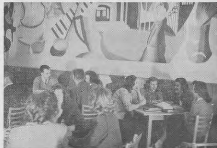
Student Center — Coffee hour, attempting to solve world problems