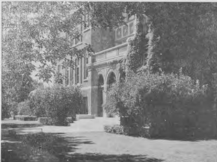
Weld Hall—By shady walks and leafy groves