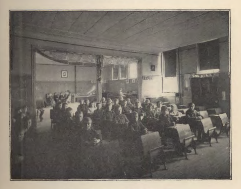
DEPARTMENT OF PSYCHOLOGY