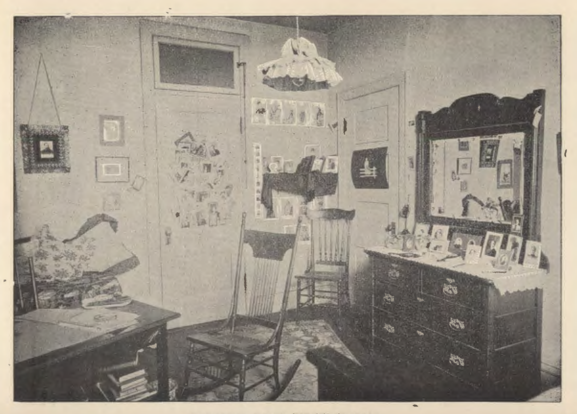
STUDENTS' ROOM, WHEELER HALL