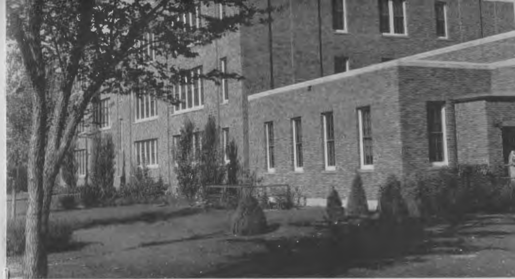
The Library Entrance to MacLean Hall

In addition to these regular curricula, rural teachers who need credits for the renewal of their limited elementary certificates will find courses in the summer term which will count both toward the renewal and toward the standard two-year diploma.