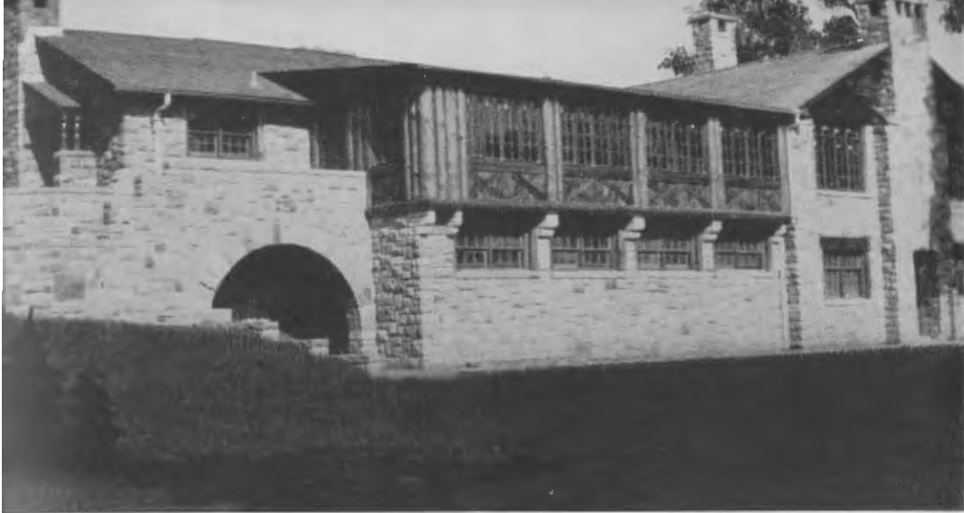
New Moorhead Country Club Building