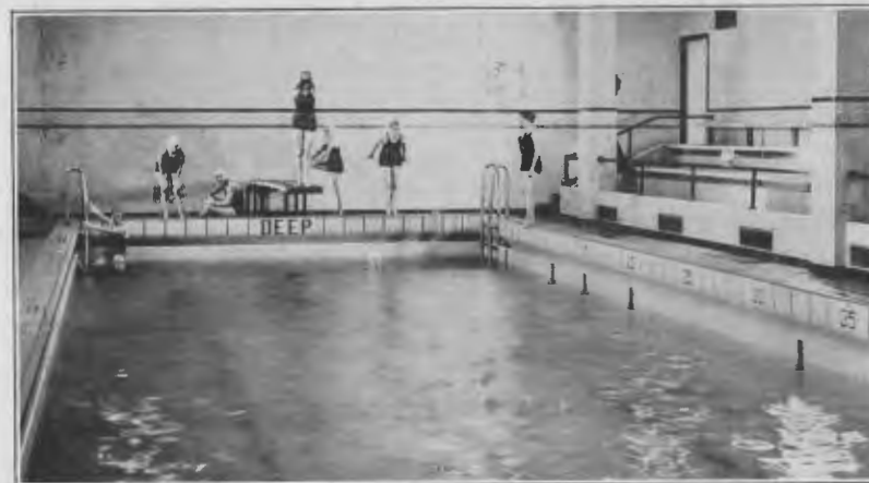
The Pool Is Open to All Students

During the session all students regularly enrolled carry eight quarter hours of work. All courses offered are four-hour courses. Classes meet four times a week in the six-week term, and five times a week in the five-week term. Physical Education or Applied Music may be taken in addition to the eight-hour load.