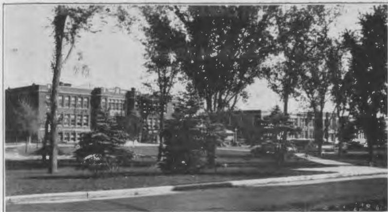
A View Across the Summer Campus