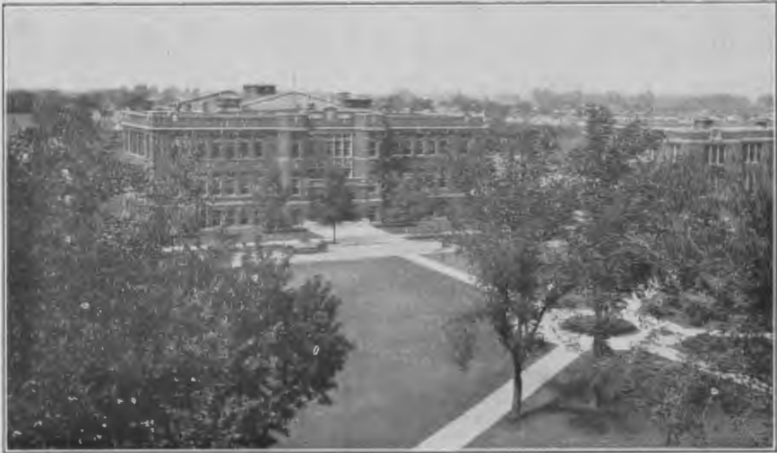
Overlooking the Campus Circle