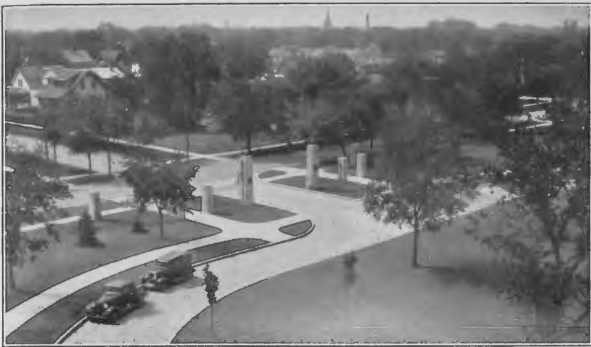
The Modern Entrance to a Modern Campus