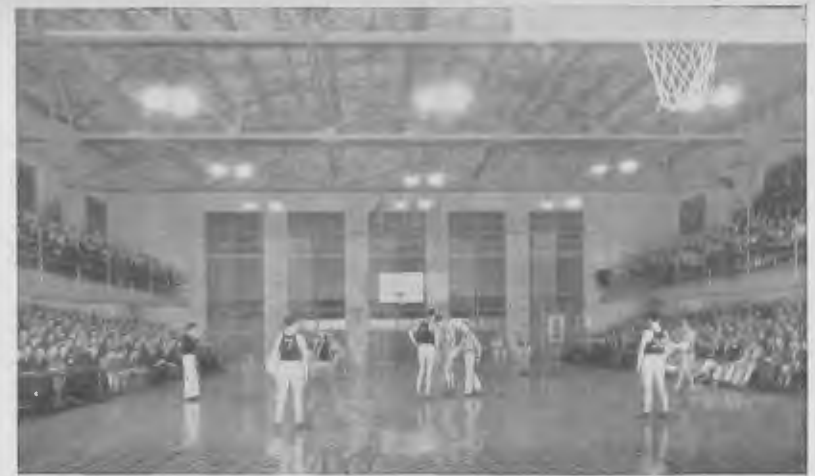
Where Athletes and Coaches Are Trained