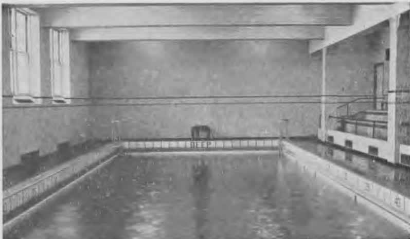
The Swimming Pool, Open to All Students

The demand for qualified teachers has become very active, and placement is good in this field. Plan to go to college this year. For further information, write The Registrar, State Teachers College, Moorhead, Minnesota.