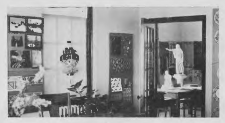
A Corner of the Art Studios