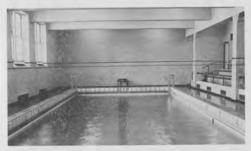
Swimming Pool in the New Physical Education Building

There will be no extension courses during the summer of 1934.