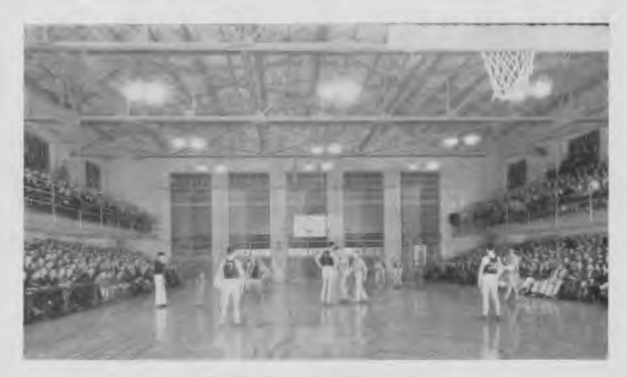
The Spacious New Gymnasium

For further information address The Registrar, State Teachers College, Moorhead, Minnesota.