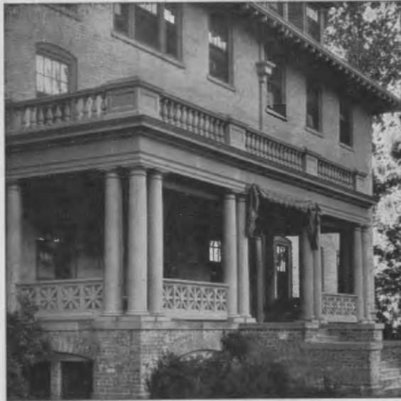
EAST ENTRANCE, COMSTOCK HALL FOR WOMEN