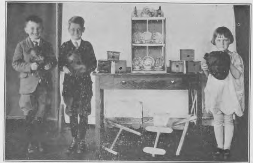
INDUSTRIAL ARTS IN THE THIRD GRADE.

The activities involved in making the house were measuring, hammering, sawing, pasting, painting, papering, and cutting. A third grade boy made a lantern to hang over the door. The girls made curtains for the windows. The second grade made furniture from fruit boxes and painted and decorated the pieces. This furniture is large enough to be used by the children. Clay dishes for the buffet were made by the first grade, and they, also, planted flowers to be used in the window boxes and made bedclothes for the bed. A rug was made by the second grade, each child weaving a block. The enthusiasm and earnestness with which the children worked, the division of labor, the co-operative sense of ownership, and the enjoyment of the house when