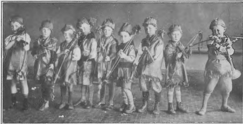
ROBIN HOOD AND HIS MERRY MEN.

We believe "the child has a right to grow through crude self-expression into a consciousness of better, more beautiful, and more satisfying form."