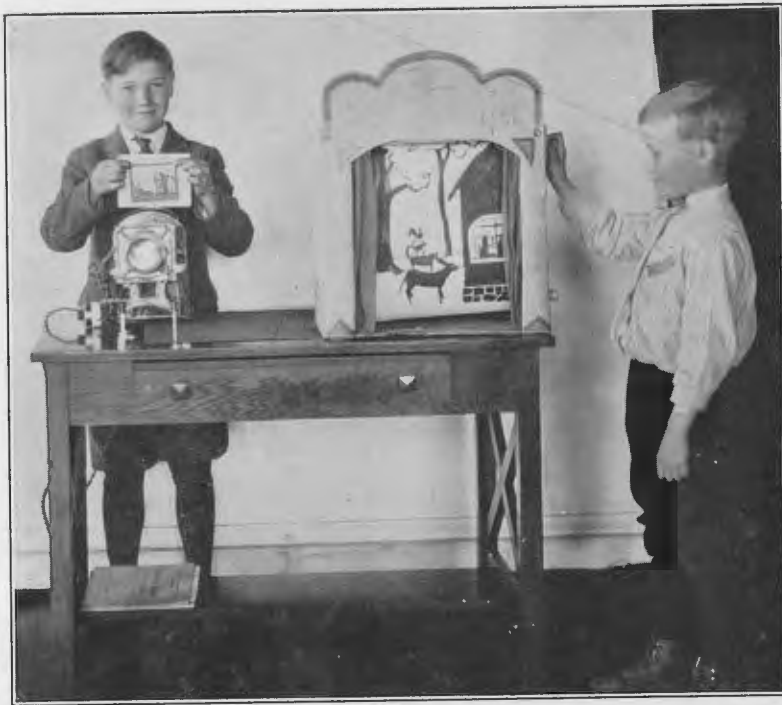
MOVING PICTURE AND SLIDES.

A study of the evolution of travel in geography was illustrated by making models of covered wagons, ox carts, aeroplanes, sleds, and cars.