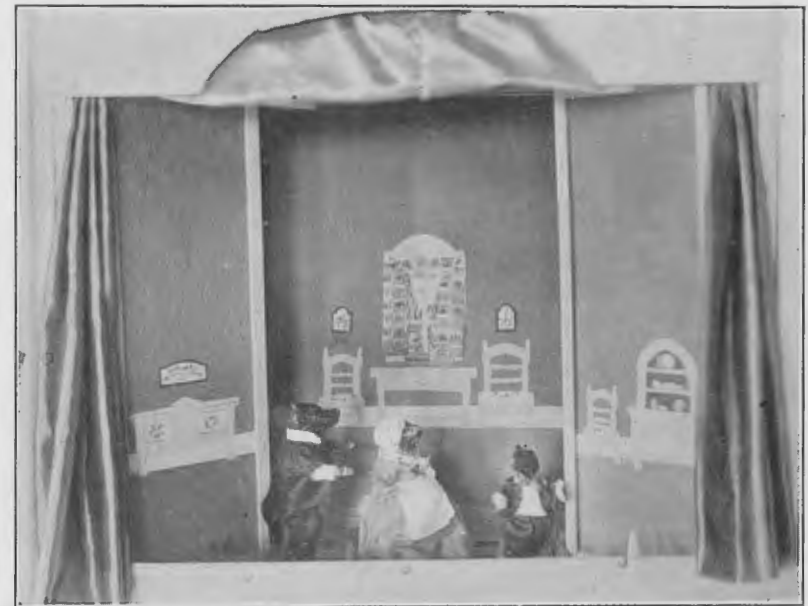
THE INTERIOR OF THE THREE BEARS' HOME.

Goldenhair: No, I wasn't hungry. I found some cake and pie and coffee