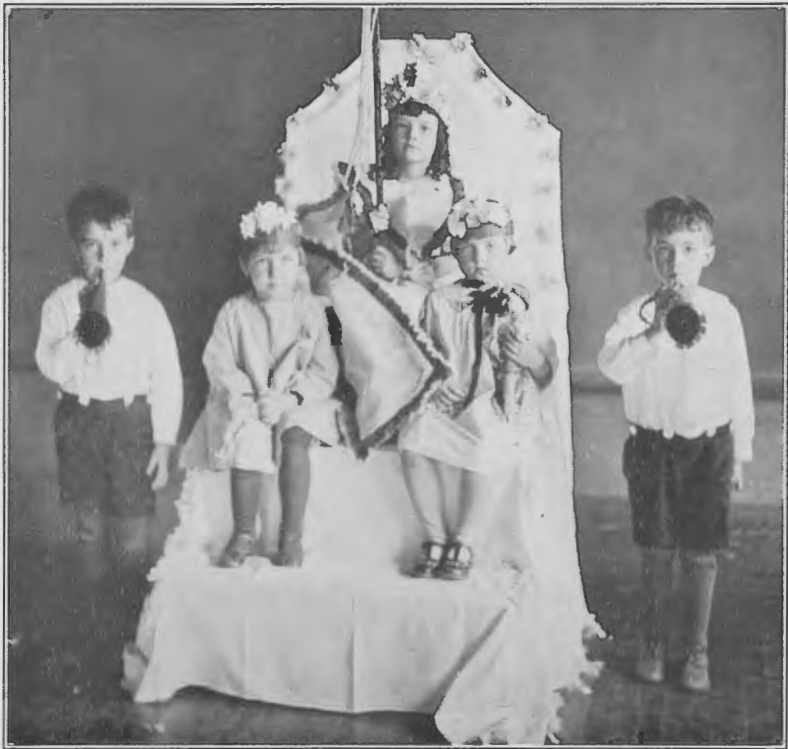
THE QUEEN AND HER ATTENDANTS.

In this network of possible interests we find it impossible to select more than one at a time to be followed throughout the year as