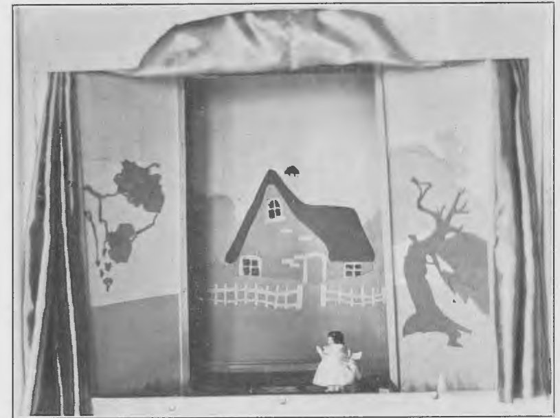
THE THREE BEARS' HOME.

We feel that the school environment can and should bring beauty to child life. Books, pictures, flowers, pottery, blackboard illustrations should incidentally help the child to know and appreciate beauty, and from the understanding and appreciation of beauty we hope will grow culture and personality that are the desirable ends of all education.