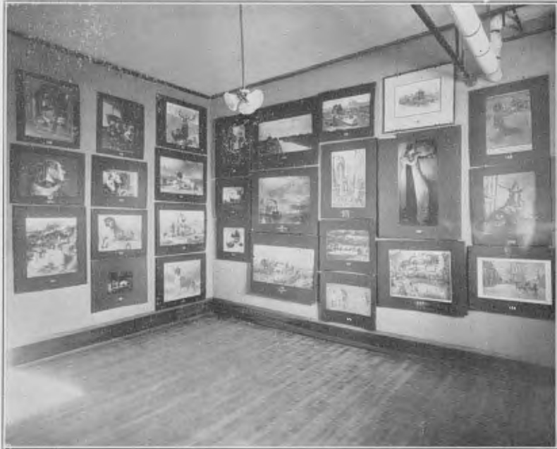
THE PICTURE EXHIBIT.

They gave a program for their mothers and friends using stories and talks about the pictures organized in language classes and in reading classes.