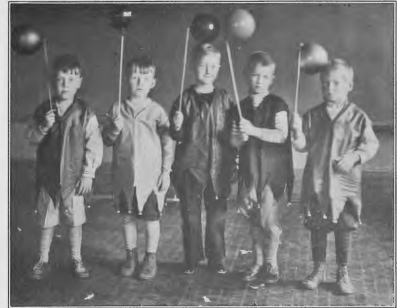
THE MORRIS DANCERS.

The story of the play told of the coming of the May Queen into the garden to enjoy the rejoicing of her subjects, who interspersed their dancing upon the green around the May pole with singing and archery contests in celebration of the coming spring.