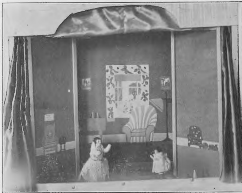
GOLDENHAIR AND HER MOTHER.