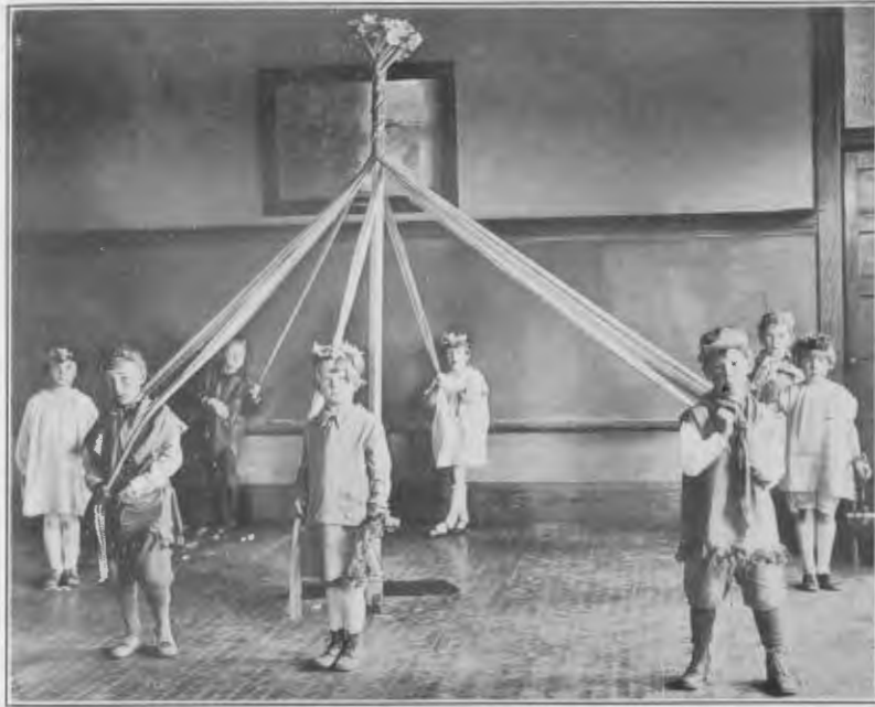
THE MAY-POLE DANCE.

a piece of careful study. During the year of 1927 we were especially interested in following the development of the arts in the kindergarten. The unit of work with which this report is concerned was the culmination of the work done by the children during many weeks.