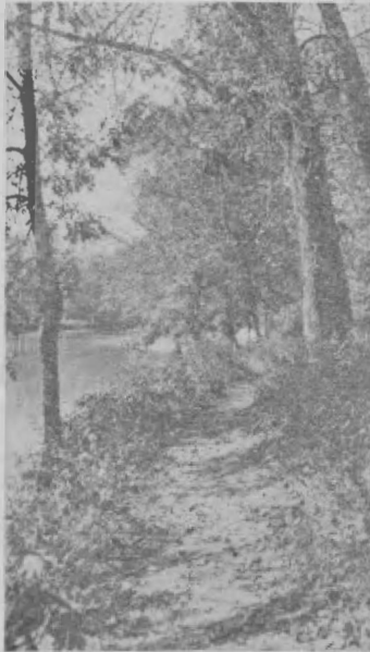
A Glimpse of the Red River