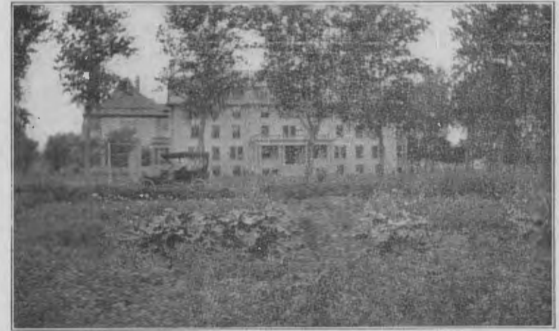
Portion of School Garden Looking Towards Comstock Hall

The Country Life Club will hold regular meetings, and the programs offered will be the results of careful planning and preparation. Altho they will vary considerably, yet some aspect of rural work will be considered each time, the aim being for every student to carry from every meeting something of help and inspiration for his future work.