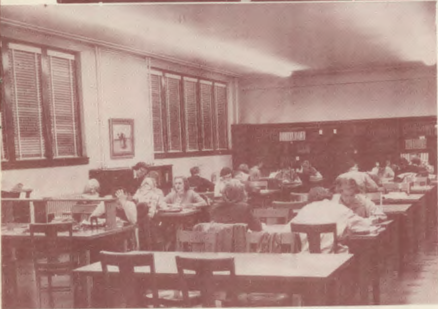
Laboratory and classrooms are available for students interested in any of the sciences. Above, a life science class works on a laboratory exercise with the aid of advanced science student assistants.