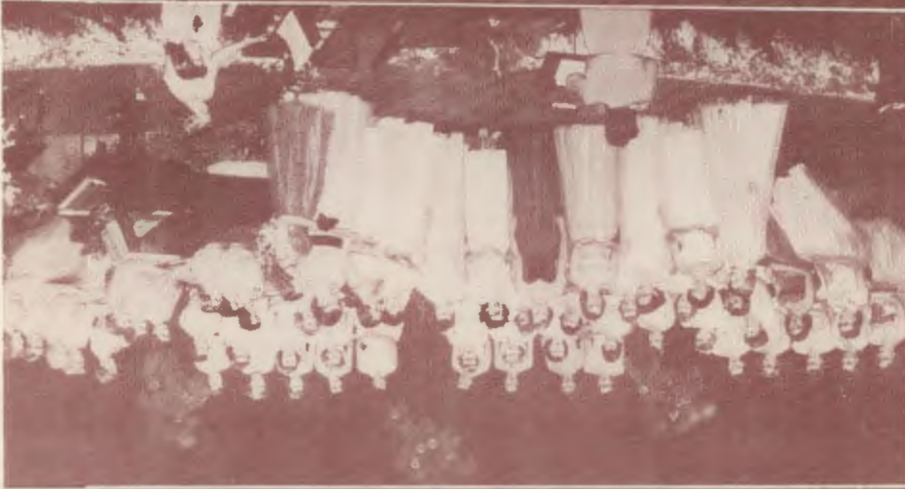
B A N D