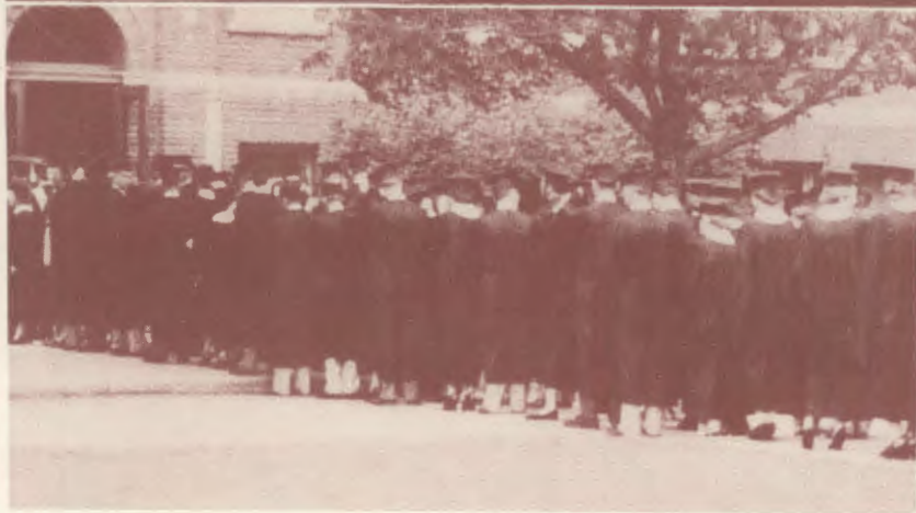
MSTC graduates make the final trip across the circle.