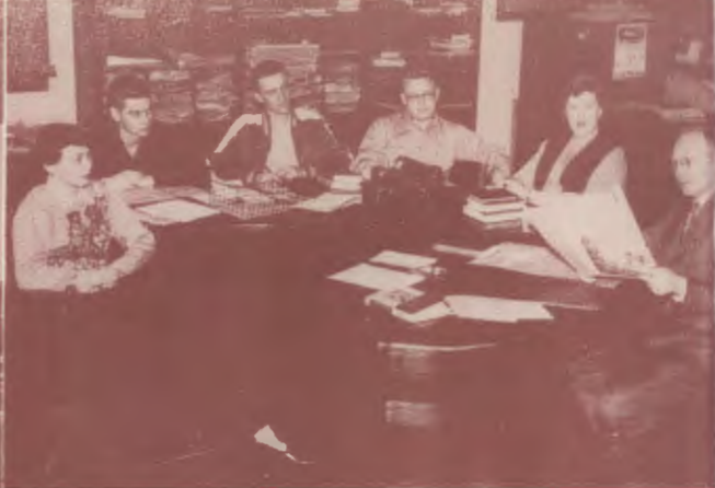
AROUND THE PAGE —Play practice, the college newspaper, Homecoming, swimming, Sadie Hawkins Day.