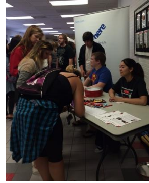
Interns gather feedback from students at the MSUM Sidewalk Café on August 23