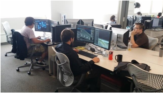
Student interns at HERE